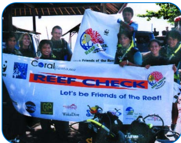
Reef Check team proudly displays their banners.

Since 1997, over 270 volunteers have been trained in Reef Check methods and educated about coral reef conservation and management. Reef Check training workshops and surveys have been conducted in 14 of 29 provinces: Sumatra Barat, Lampung, Jakarta, Banten, Jawa Barat, Jawa Tengah, Jawa Timur, Bali, Nusa Tenggara Barat, Nusa Tenggara Timur, Kalimantan Timur, Sulawesi Utara, Sulawesi Selatan, and Sulawesi Tenggara.