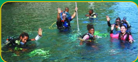
Divers wave before descending underwater to survey the reefs of the Soufriere Marine Management Area in St. Lucia.

Reef Check Europe represents the Reef Check organization at scientific conferences and public events. The organization also works together with other coral reef NGOs and serves as a regional coordinator of the global Reef Check network, which brings together interested volunteers and scientists, and offers assistance in setting up of Reef Check surveys and training workshops.