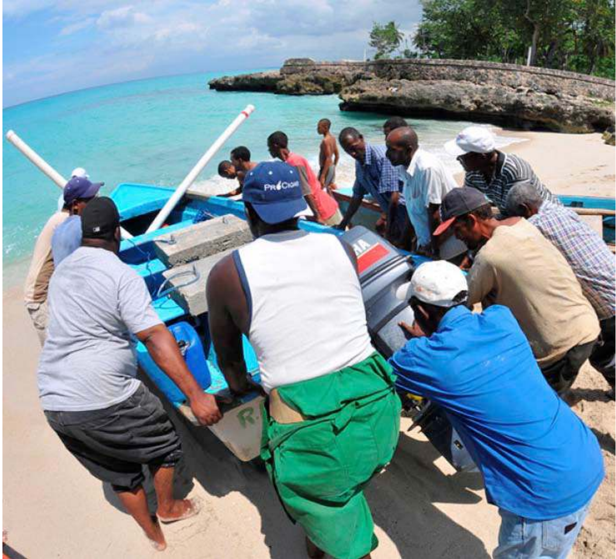
COMMUNITY SUSTAINABLE MANAGEMENT OF La Caleta National Marine Park