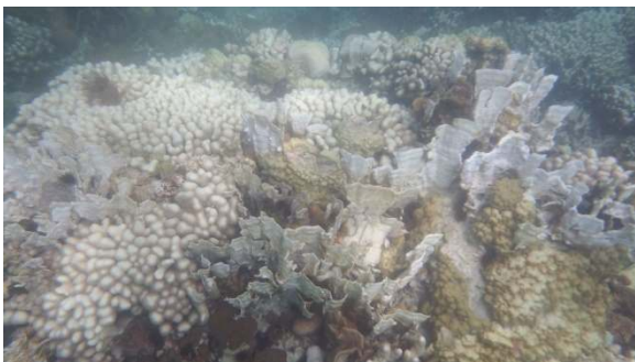
Haiti's reefs weren't spared from bleaching during the 3 rd Global Coral Bleaching Event