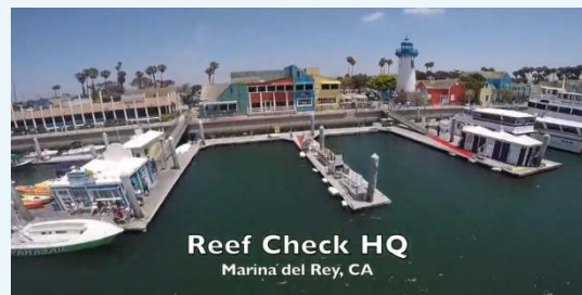
New Reef Check Headquarters office at Fisherman's Village in Marina del Rey