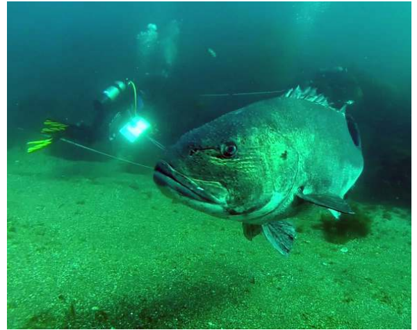
A Giant Black Sea Bass seen during the Channel Islands EcoExpedition