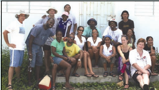
Negril Dive Team 2006