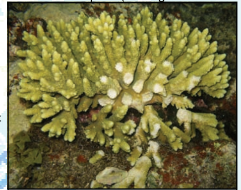
Acropora colony broken by human impact

The 'Dahab Reef Monitoring' will not only provide core data for the global Reef Check database, but is particularly intended to serve as a basic tool in conservation management of the South Sinai coastal environment. The data will provide greater detail, specificity and validity for interpretation, better detectability of changes in reef health and thus assist resource managers of the protected areas in design and implementation of environmental action plans. The procedures of the 'Dahab Reef Monitoring' are by no means restricted to Dahab and its surroundings, but may well be applied to other reef sites both along the Gulf of Aqaba and further sites along Egyptian Red Sea shores. For information or to find out how you can help: office.dahab@redsea-ec.org