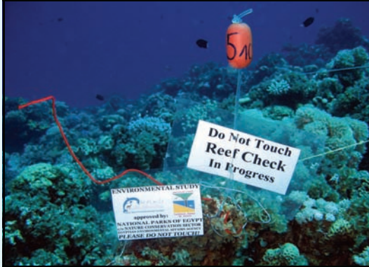
Transect end marker: Do Not Touch, Reef Check in Progress