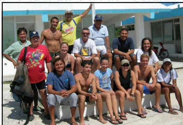
Participants in the 2nd Training of Trainers in Cozumel

As a result of this training, we now have over 15 certified training instructors in locations ranging from Japan to Jamaica, and are moving full speed ahead to produce more trainers. We have already had three subsequent trainings of trainers in Mexico, Guatemala and Belize for divemasters and instructors to further the EcoAction program. Results have been great and many dive shops are now selling Reef Check EcoAction products and courses, including Paradise Dive in Cozumel, the island's largest dive shop! Check the Mark Your Calendars section on page 7 for scheduled trainings in 2007, and check the website as trainings are constantly being added to the list. For more information, contact us at ecoaction@reefcheck.org .